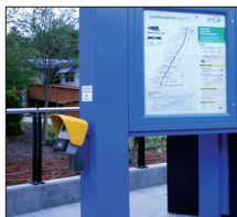
Yellow ORCA card reader and route map kiosk