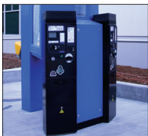
Ticket vending machines

Pay your fare at the station before the bus arrives. Use the ticket vending machines or the ORCA card reader.